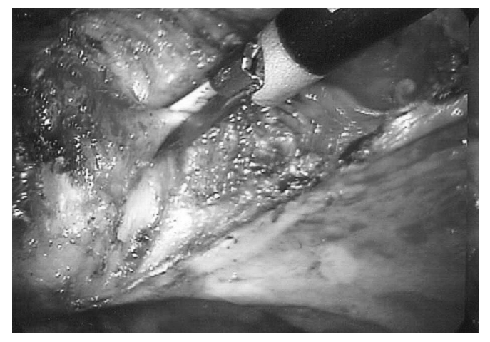
Figure 2. After incising the cardinal ligament, the pliant vaginal wall is palpated laterally, anteriorly, and posteriorly to confirm the location of the cervicovaginal margin. Then, the vaginal wall is incised into with the Ultrasonic scalpel.

OH, USA) suture in 3 or more figure-of-eight (technically spiral) sutures with Semb graspers and a Wolfe needle driver (#8393.502, Richard Wolf Surgical Instruments, Vernon Hills, IL, USA), fixing the vaginal angle to the uterosacral ligaments for suspension.