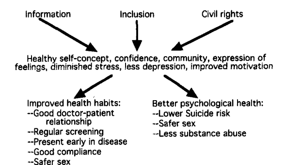
Fig. 3. How reduced homophobia improves public health.

sexual citizens the same protection now guaranteed to others on the basis of race, creed, color, etc. Further the APA supports and urges the repeal of all discriminatory legislation singling out homosexual acts by consenting adults in private" (106). In 1992, the American Medical Women's Association (AMWA) passed, without opposition, a policy statement urging "national, state, and local legislation to end discrimination based on sexual orientation in housing, employment, marriage and tax laws, child custody and adoption laws; to redefine family to encompass the full diversity of all family structures; and to ratify marriage for lesbian, gay and bisexual people . . . creation and implementation of educational programs . . . in the schools, religious institutions, medical community, and the wider community to teach respect for all humans" (107). The American Medical Association (AMA) voted to include the words "sexual orientation" in its nondiscrimination statement in 1993, and in 1994 issued a Policy Statement committing itself "to taking a leadership role in educating physicians on the current state of research and knowledge of homosexuality . . . which should start in medical school [and] must be part of continuing medical education" (1).