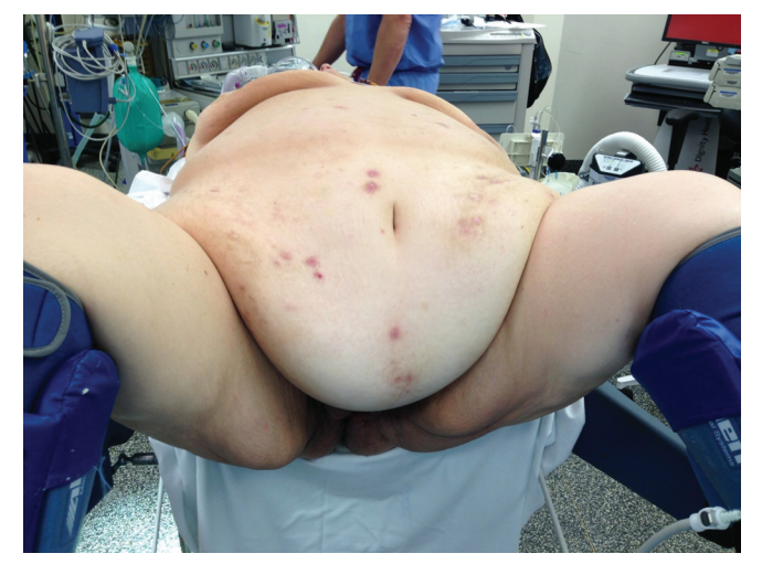
Figure 1. Patient with BMI 53, positioned in modified lithotomy with arms tucked at her side, shoulder support, panniculus in dependent position.

office computer under Investigational Review Board approval.