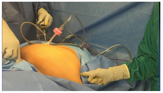
Figure 4. The assistant on the right in photo, is pointing posteriorly to the cervix as the surgeon on the left side of photo, is pointing to the cervix with forearm in straight line from elbow to cervix. The incision in the abdominal wall is located where the finger touches the abdominal wall, usually a few centimeters above the anterior superior iliac crest, and medial by about 2 cm.

patients were prepped and draped in a single-field fashion. ^{\rm 6}